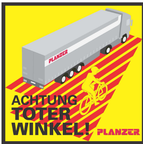
Planzer's version of the safety labels

As a 100% family-run business, the subject of road safety has always been particularly close to Planzer's heart. That is why Planzer, with the help of specially trained instructors, has been teaching primary school children for many years about the implications of a driver's blind spot at various Planzer locations throughout Switzerland. As an additional preventive measure, in April 2014, the Planzer Group has put an eye-catching yellow safety notice on the majority of its fleet, totalling several hundred lorries across Switzerland.